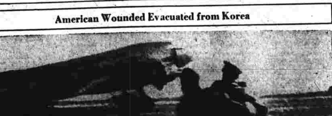
A wounded American soldier is shown being carried to a waiting plane for evacuation from an unidentified South Korean city.